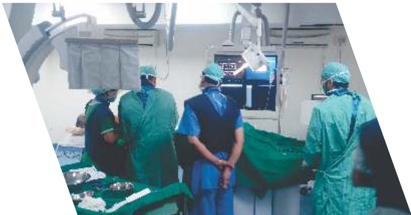
No. of Radiological investigations (CT Scan etc): 3 Millions+