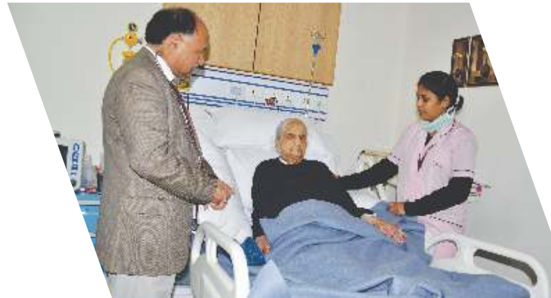
No. of Indoor patients treated: 3 Millions+