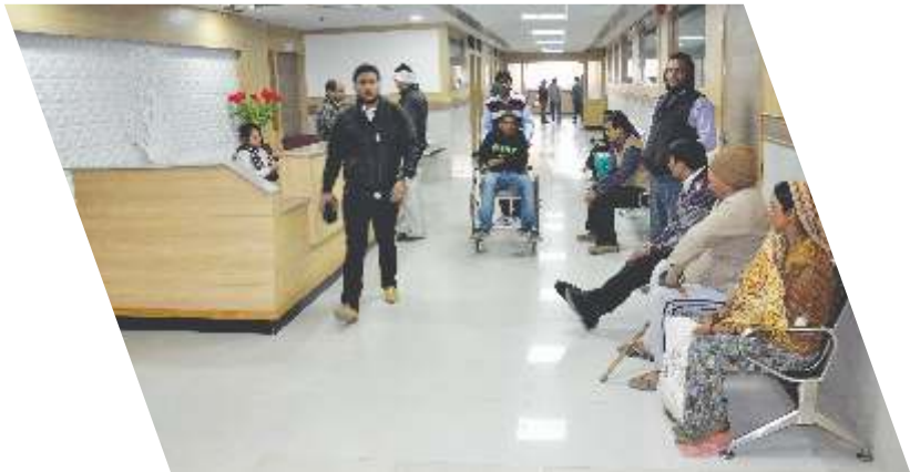
No. of Outdoor patients treated : 20 Millions+