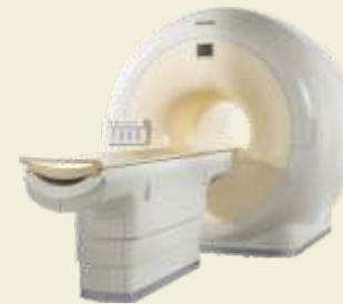
MRI 3 Tesla