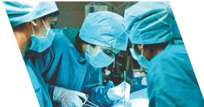
No. of Surgeries performed: 1 Million+