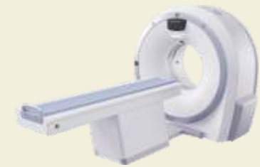
128 Slice CT Scan